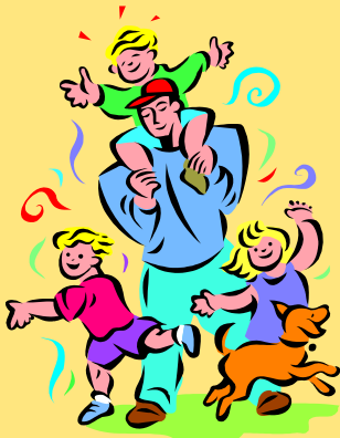
We're going to go on a Great Family Vacation!

Have you been saving for sometime for that perfect family vacation, but you just don't seem to save enough to take everyone? Now for the months of June & July get the extra money you need to make it happen. Don't rely on a credit card or multiple credit cards to pay for everything. Come in for a great rate @ 6.00%. Term is for up to four years and a maximum of $10,000 limit.